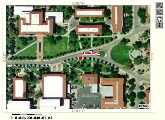
Free aerial imagery provides an eye-popping backdrop to real-time asset locations!

WebTracks 24/7 is licensed as a stand-alone application for organizations requiring asset-tracking capabilities. As such, WebTracks 24/7 is installed as part of the customer's Internet infrastructure, allowing for full in-house customization. For example, customers may add custom data layers such as customer locations, store locations, or sales territories. Once part of an organization's Internet presence, WebTracks 24/7 can be branded to provide a fully functional, yet seamlessly integrated and professional application ideal for Internet or Intranet use.